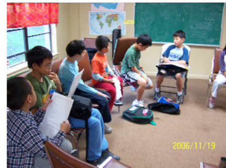
Grades are given

The school serves PreK-adults, has approximately sixty students, eleven Chinese classes (nine levels), one dance class, and one art class. Students are assigned to class based on age and Chinese proficiency levels as determined by parents’ opinions and teachers’ observations at the school. Students are either born in China or raised in the U.S. or are American-born. In 2007, the school gained a larger enrollment of native English speakers, including children and adults.