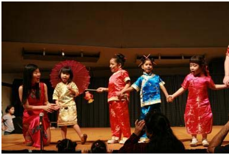
Alamo Asian Festival