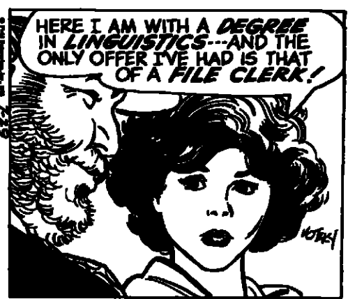
Apartment 3-G by Alex Kotzky