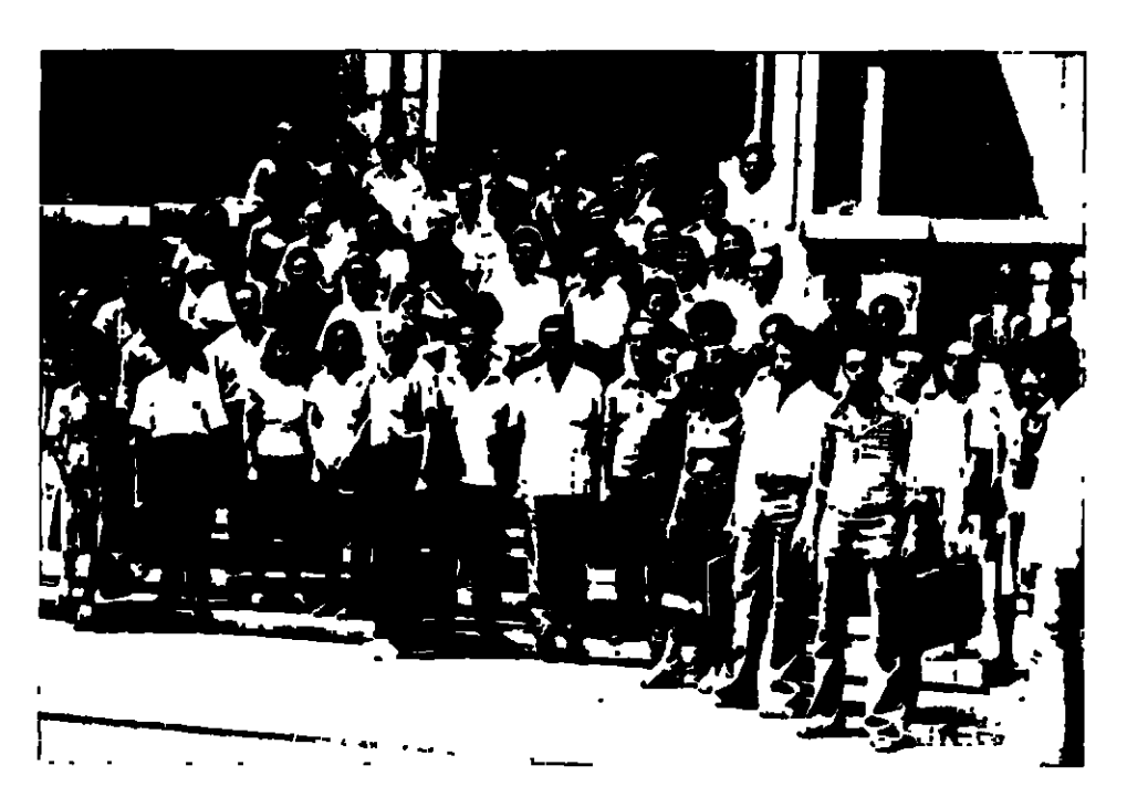
The students and faculty of the Third Middle East Linguistic Institute

A special outgrowth of this year's Insti-See MELI-16, Col 1