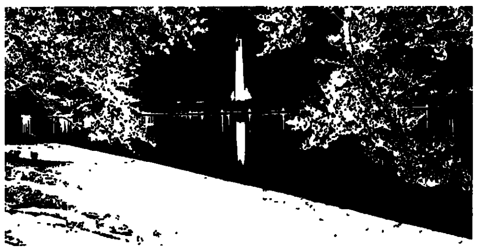
Weshington Cherry Blassoms in April