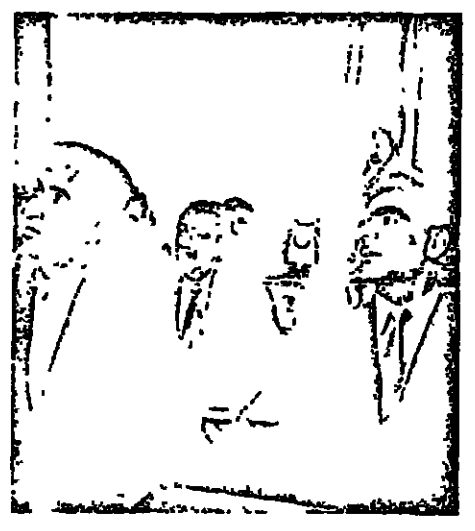
La classe—Los étudiants écoutent et regardent

This is why the presence of the professor is indispensable. After the showing of the film, he reviews the latter image by image, and trics to make each sentence perfectly clear, by references to reality, by mimicry or by drawing. Translation is used only when all other means of explanation becomes impossible. This comprehension phase normally prepares the