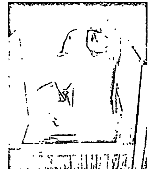
Un cabine du laboratoire--Un professeur écoute un enregistrement effectvé par un étudiant.