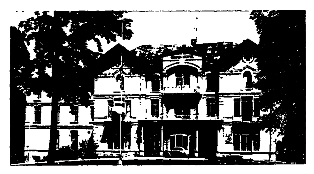
Hotel Groot Berg en Dal where the Conference sessions took place