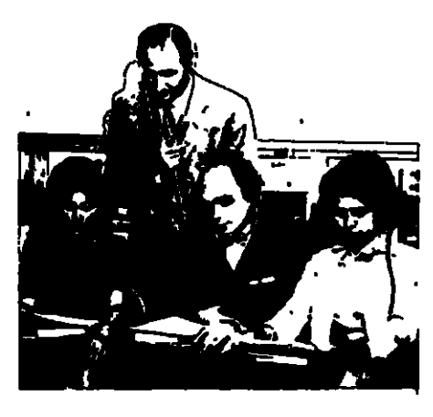
Lab session at Institute's Center

recording student oral production without the student's knowledge is being investigated as an aid in diagnostic language testing. The Institute reports encouraging results from the classroomlaboratory phase of its curriculum.