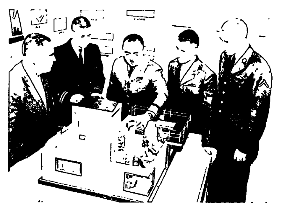
DLI Classroom: Air Force Major 'Furnishes' Model Home

The Commission on Accreditation of Service Experiences (CASE) of the