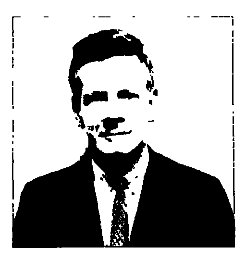
Charles W. Kreidler

American linguists have been generally critical of the way our primary and secondary schools deal with the study of English. What passes for instruction in the native language is said to perpetuate the authoritarian viewpoint and Latinesque descriptions of 18th-century grammarians, and to be out of touch with subsequent thinking and scholarship. The kind of English grammar taught in our schools has been charged with presenting an inaccurate view of the language because it is based entirely on written usage and consequently fails to describe the sound system, the stress and intonational patterns, and the junctural features of the spoken language; because its categories are derived from Latin grammar and are thus not wholly appropriate to